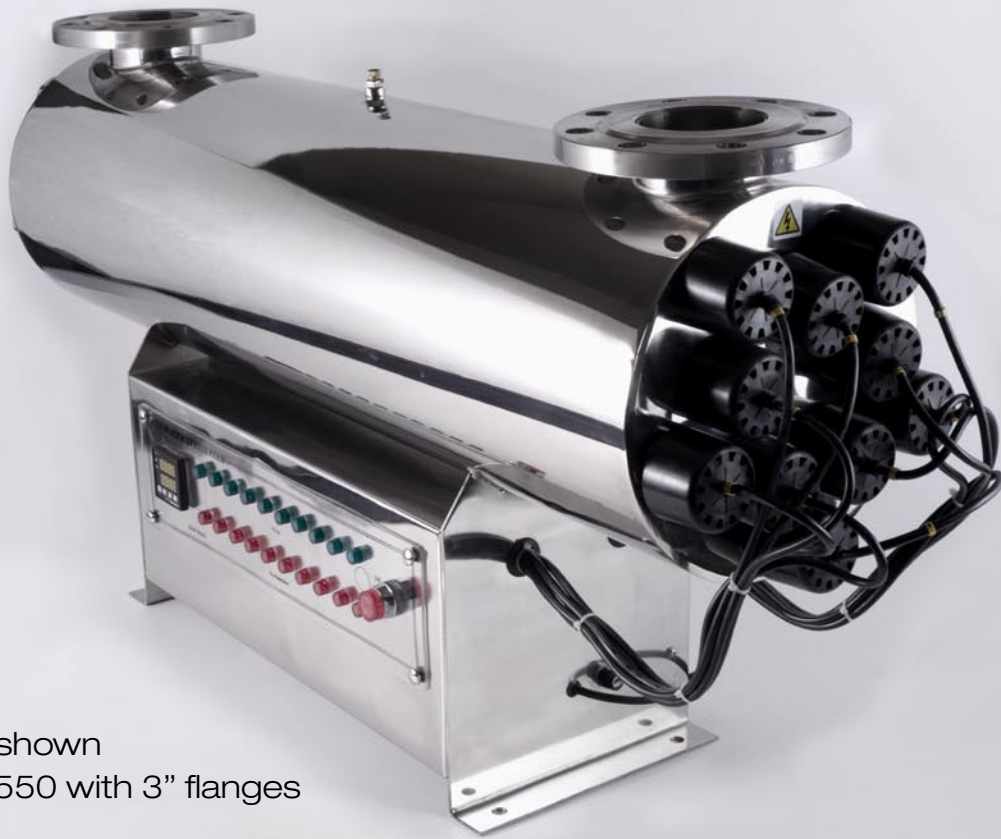
model shown UV-CS550 with 3" flanges